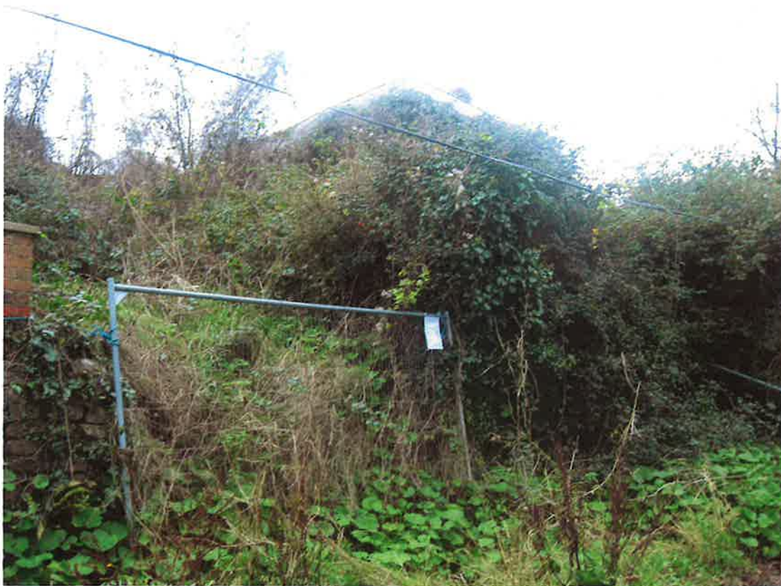
Photograph 3 –Date taken: 23.11.2011 – View of derelict property from public road.

Derelict site: 'Elm lawn' Loughbeg, Ringaskiddy, Co. Cork.