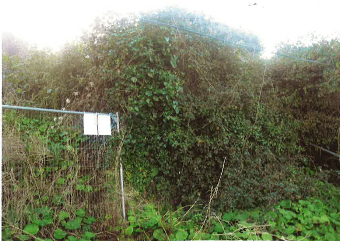
Photograph 2 – Date taken: 7.12.2011 – View of Section 8 (7) Notice