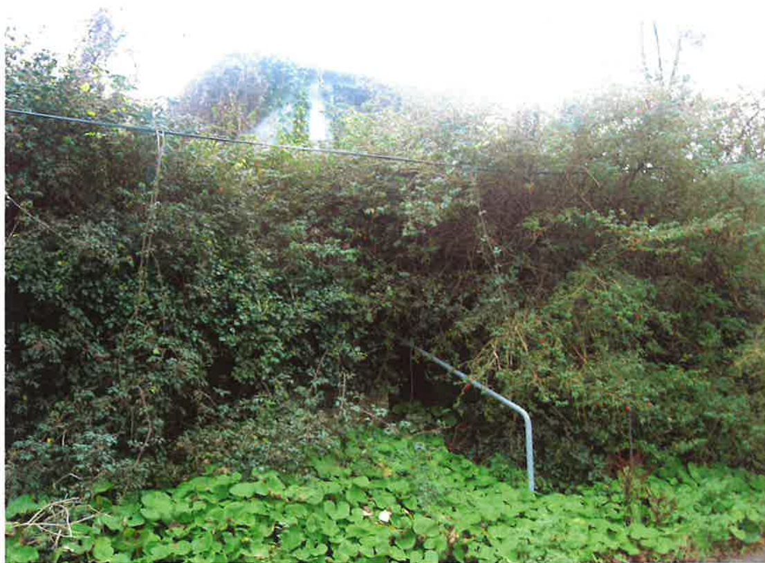
Photograph 1 –Date taken: 23.11.2011 – View of derelict property from public road.

Derelict site: 'Elm lawn' Loughbeg, Ringaskiddy, Co. Cork.