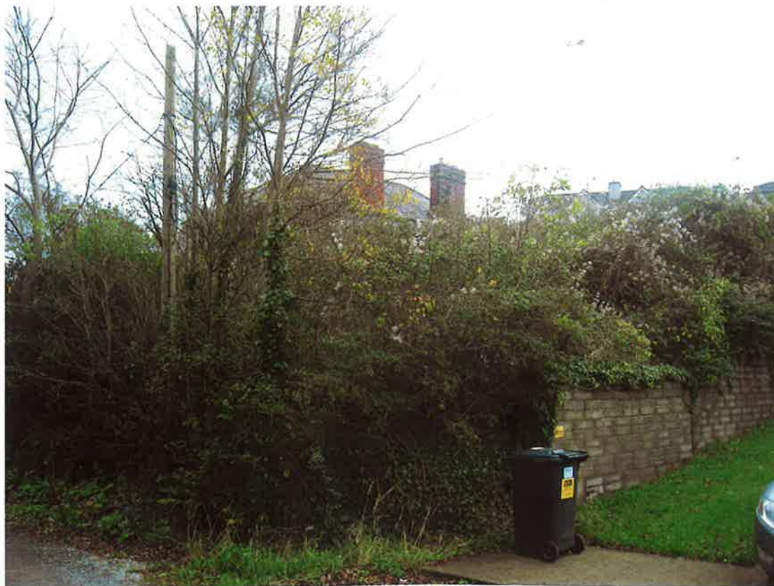
Photograph 2 –Date taken: 23.11.2011 – View of derelict property from public road.