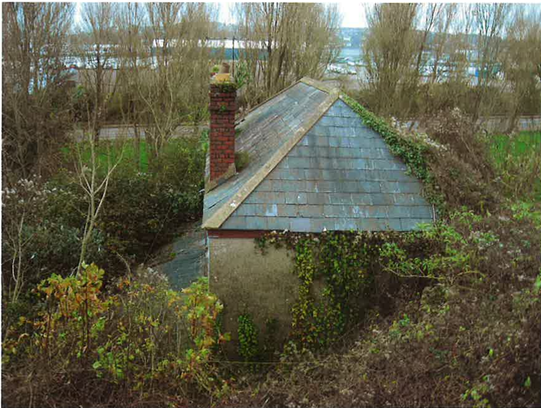
Photograph 4 –Date taken: 23.11.2011 – View of derelict property from public road.