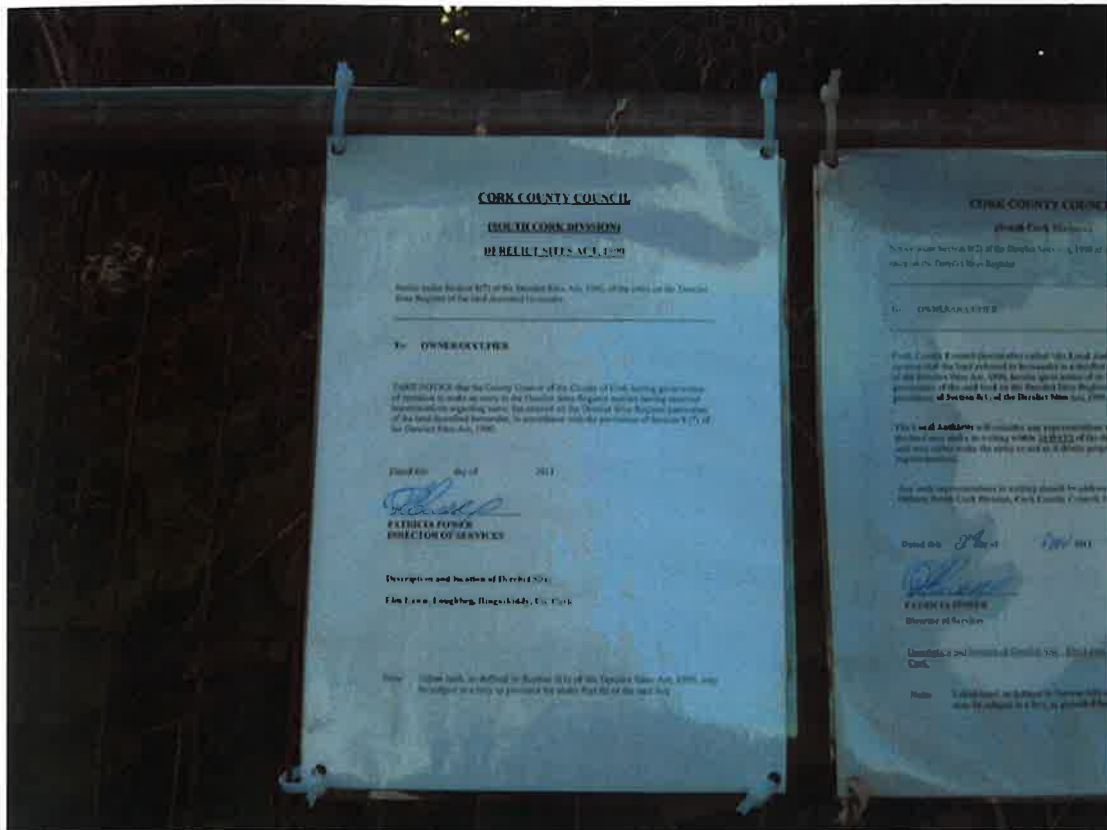
Photograph 1 –Date taken: 7.12.2011 – View of Section 8 (7) Notice

Derelict site: Elm Lawn, Loughbeg, Ringaskiddy, Co. Cork.